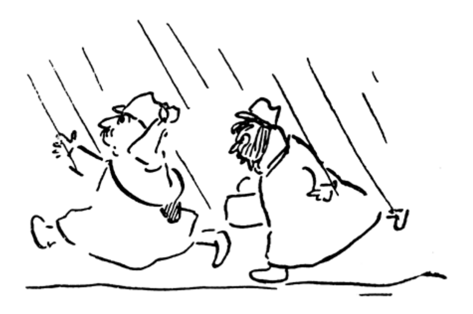
Precipitate start of the Wild Ass hunters.