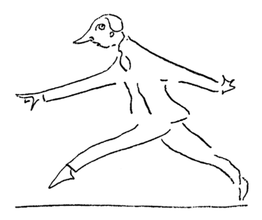
The first departure.

about the middle of the assembly had discovered a draught, and was silently but conspicuously negotiating for the closing of a window by an attendant, and at the back a cultivated-looking young gentleman was stealing out on tiptoe.