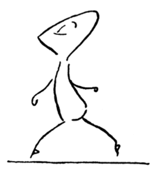
Too high-pitched even for Reginald.