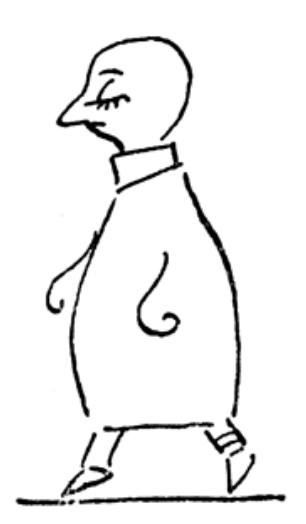
The second departure.

"At this point there was a second departure.