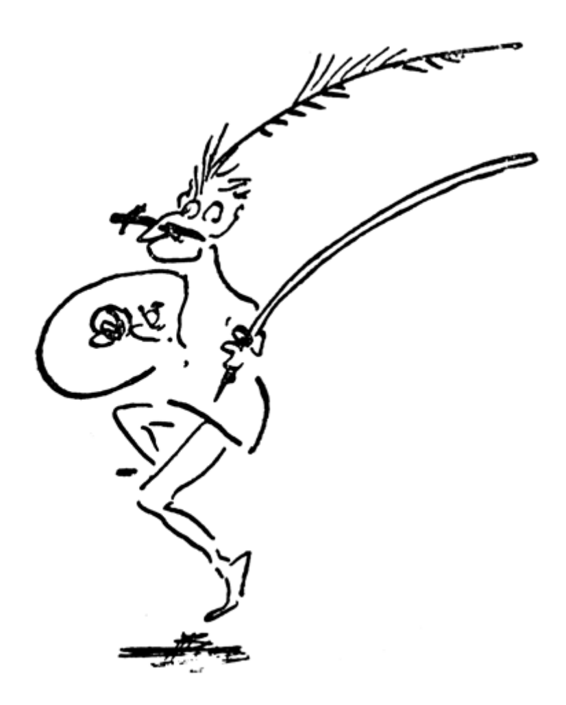
The soul of Mr. Osborn doing a war dance (as a Spartan Red Indian) in order to work itself up for a "Morning Post" article.