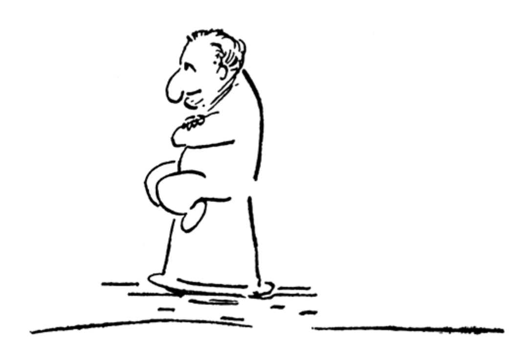
Dodd the Agnostic just before the flowerpot broke.